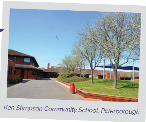
Ken Stimpson Community School, Peterborough

With a total value of over £70,000 were awarded to neaco schools across East Anglia